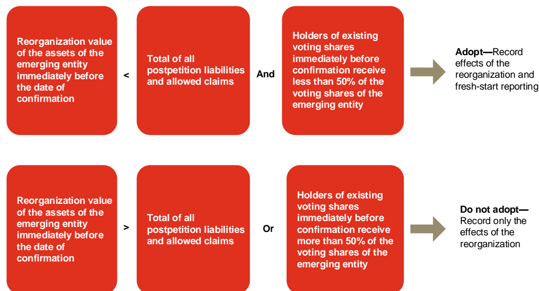
Figure BLG 4-1 Criteria for applying fresh-start